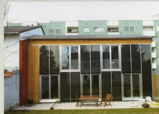
The Costs & Benefits of Comfortable Housing for Ireland. Report prepared for Energy Action Ltd. Dublin: 1999

[DOEHLG 2002] Department of the Environment, Heritage and Local Government, 2002. Technical Guidance Document Part L: Conservation of fuel and energy .